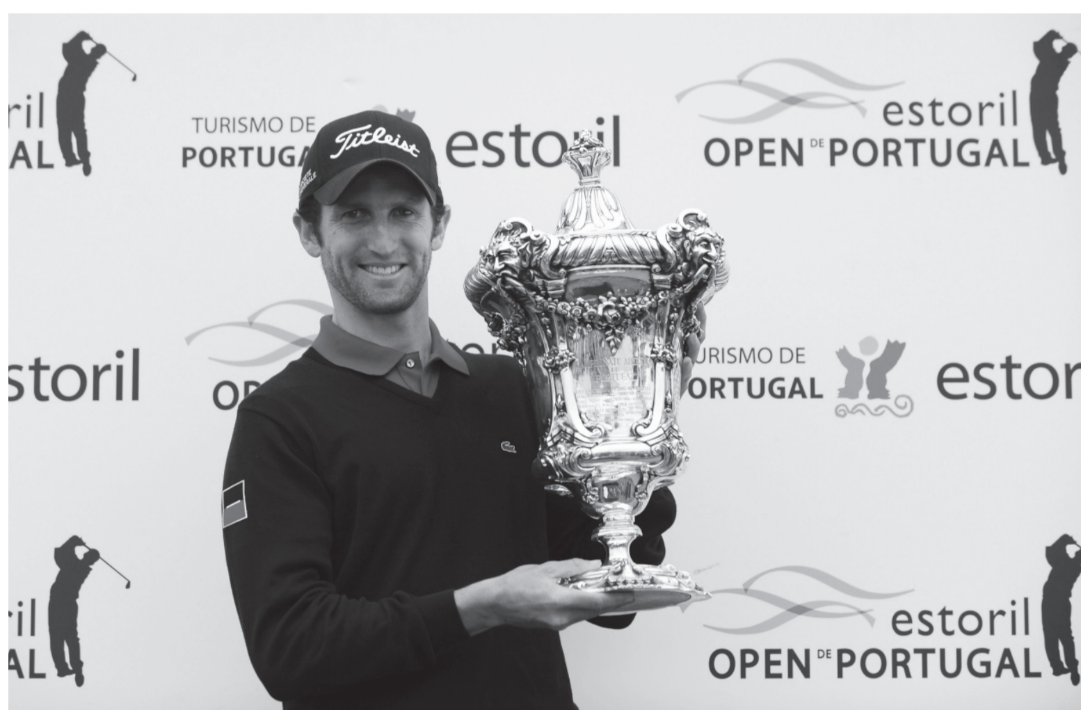
Grégory Bourdy, 2008 Champion

EUROPE'S BEST POST GREAT SCORES INCLUDING A COURSE RECORD